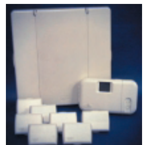
8 Zoning Points & Controller System

By delivering conditioned air only to areas that are in use, a zoning system eliminates the needless waste of keeping unused areas comfortable. In fact, the systems can actually pay for itself with the money you'll save on your utility bills.