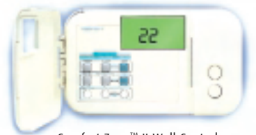
Comfort Zone™ II Wall Control

Comfort Zone™ II is the ultimate in prestigious climate control for your home. It enables you to program up to eight zones with individual time and temperature settings throughout your home for absolute comfort. Carrier's Comfort Zone™ II control saves up to 30% system energy consumption over other controller systems. You can tailor your air conditioning to suit the precise requirements of your home.